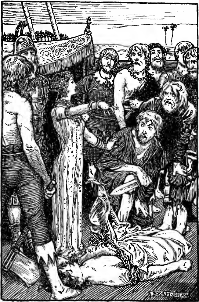
PHILAMMON AMONG THE GOTHs